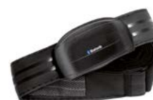
HEART RATE MONITOR

LPG SYSTEMS S.A. INTERNATIONAL // MARKETING 2753, Route des Dolines - BP 243 06905 Sophia-Antipolis Cedex France Tel.: +33 (0)4 92 38 39 00 Fax: +33 (0)4 92 96 09 65 www.huber360.com